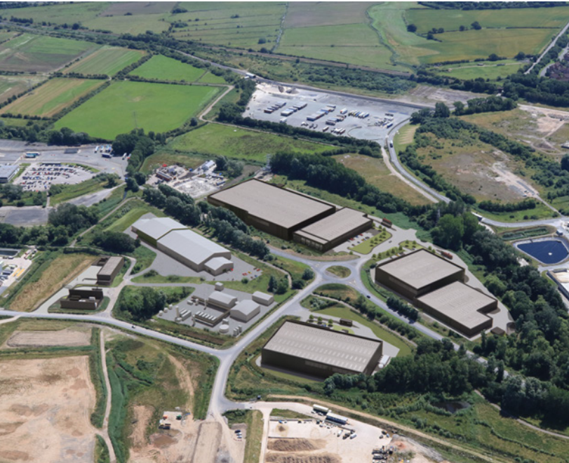
Plastic Park at Protos given green light to go ahead.

Protos is a destination for energy, innovation and industry. Welcome to the latest edition of our community newsletter where you can find out what's been happening at the Protos site and what to expect over the coming weeks and months.