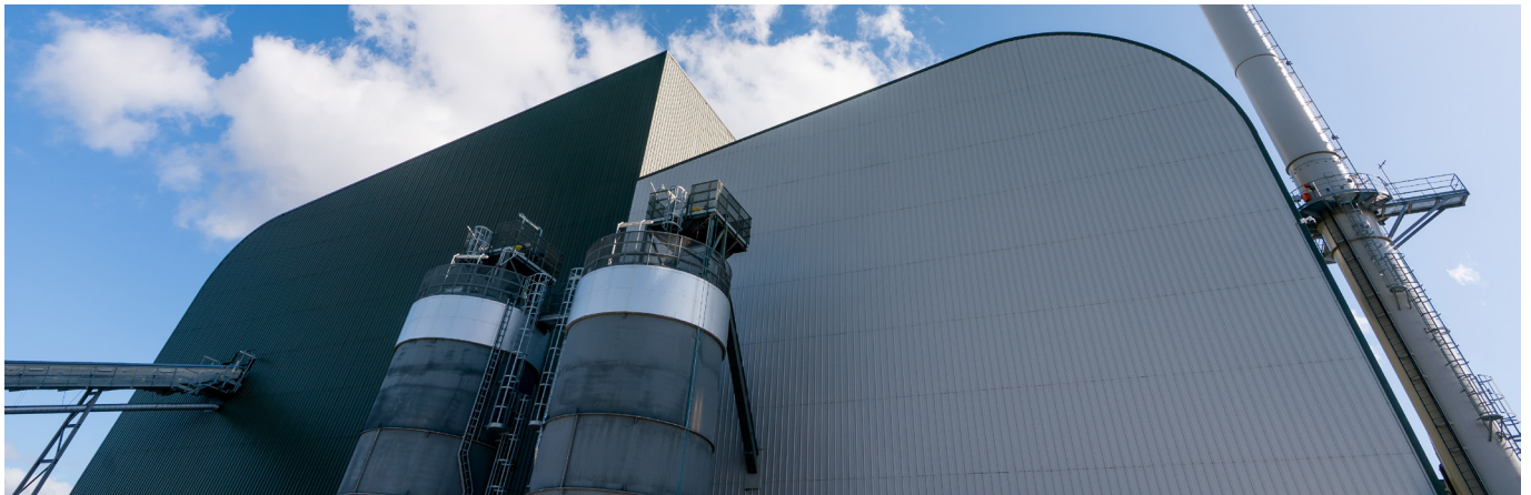
Ince Bio Power

The project is being led by BIG which owns, operates, and manages the Ince Bio Power Plant - the largest waste wood gasification plant in the UK. The 22 MW facility uses commercial waste wood which would otherwise go to landfill, to produce energy for over 42,500 homes.